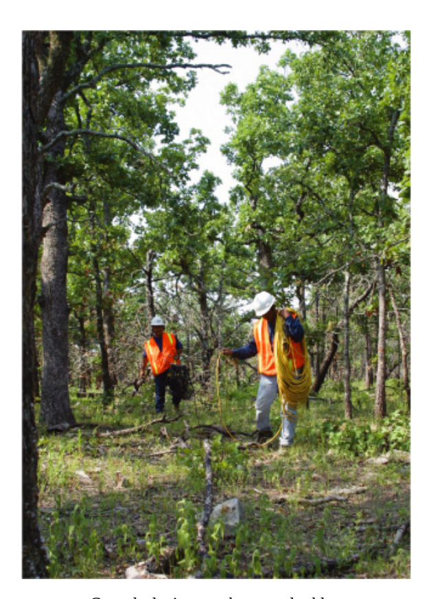
Crew deploying geophones and cables.