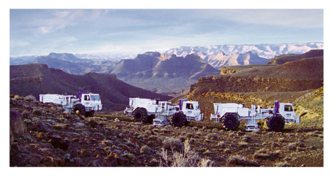
Vibrator energy source units operating in Utah.