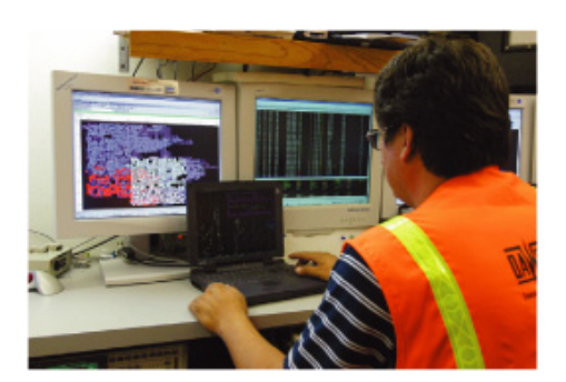
Technician operating a seismic recording system.